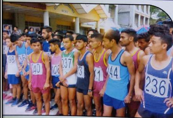
Our Men's Team won Third Position in H.P.U. Inter College X-Country Championship held at Govt. College Banjar.

She bagged Bronze Medal in 400 mtrs race at H.P.U. Inter College Annual Athletic Meet.