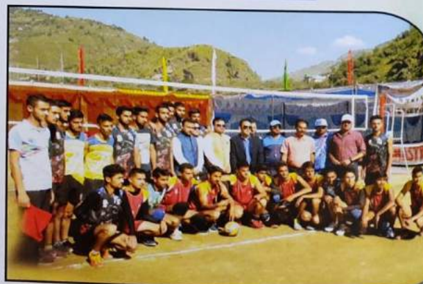
Our Men's Volley Ball Team gave its best ever performance by entering into Semi-Final of the H.P.U. Inter-College Volleyball Championship.